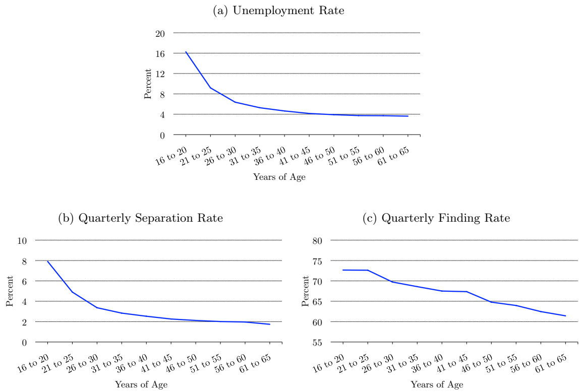
Figure 1: Unemployment, Separation, and Finding Rates by Age in the U.S.