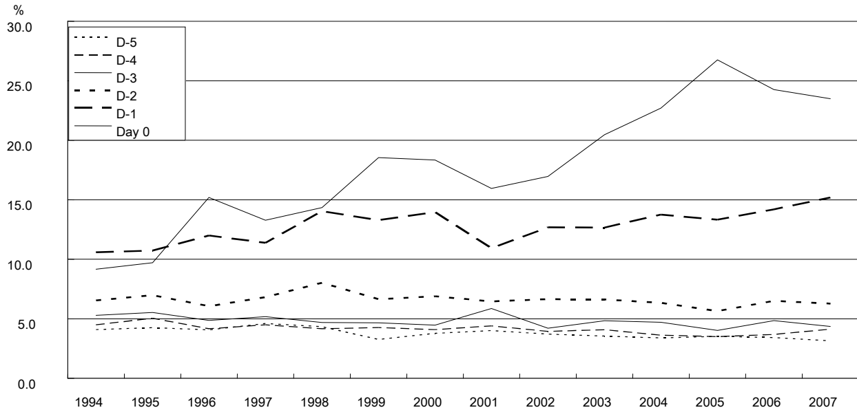
Panel B; Sub-samples Categorized by the Direction of Jumps and Subsequent Revisions